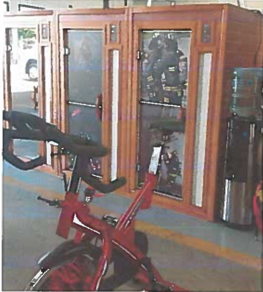
Example form Comox Fire Department

The introduction of decontamination saunas will greatly complement our fire departments Health and Wellness program.